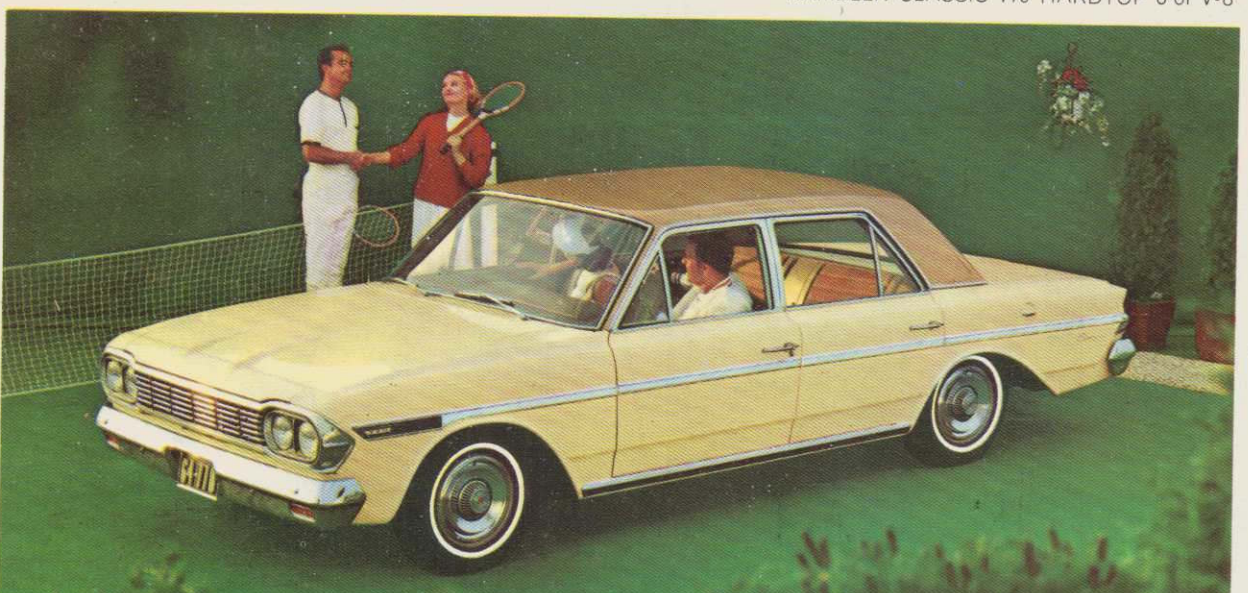
CLASSIC 770 4-DOOR SEDAN 6 or V-8 (2-door model also available)