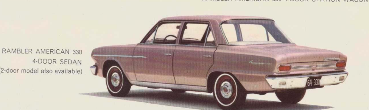
RAMBLER AMERICAN 330 4-DOOR SEDAN (2-door model also available)