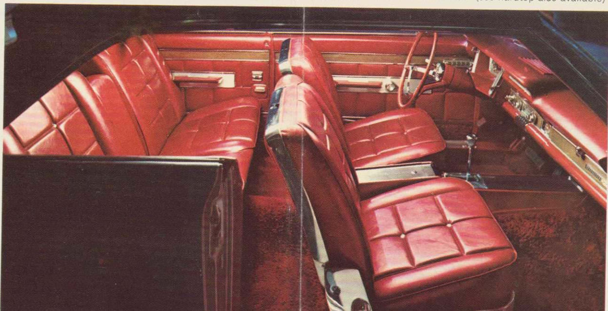
UNSURPASSED INTERIOR LUXURY ON ALL '64 AMBASSADORS! Ambassador V-8 990-H hardtop, shown