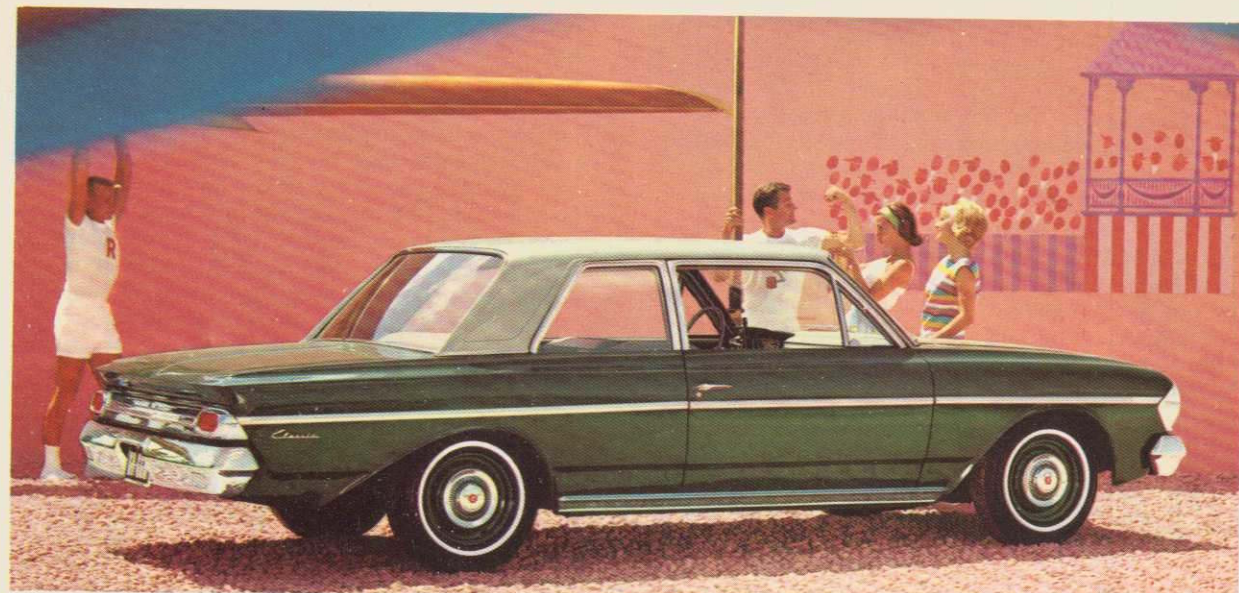
RAMBLER CLASSIC 660 2-DOOR SEDAN 6 or V-8 (4-door model also available)