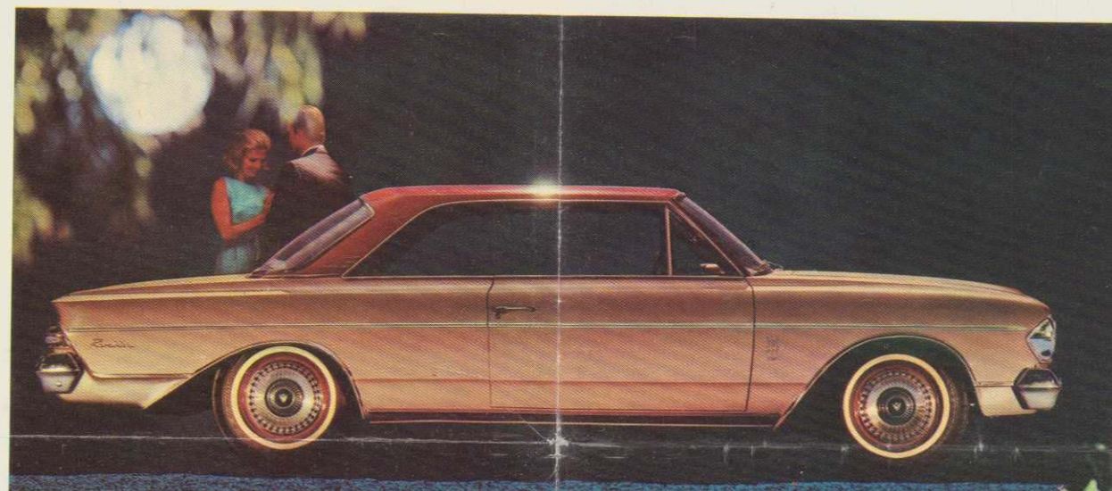
RAMBLER AMBASSADOR V-8 990-H HARDTOP (990 hardtop also available)