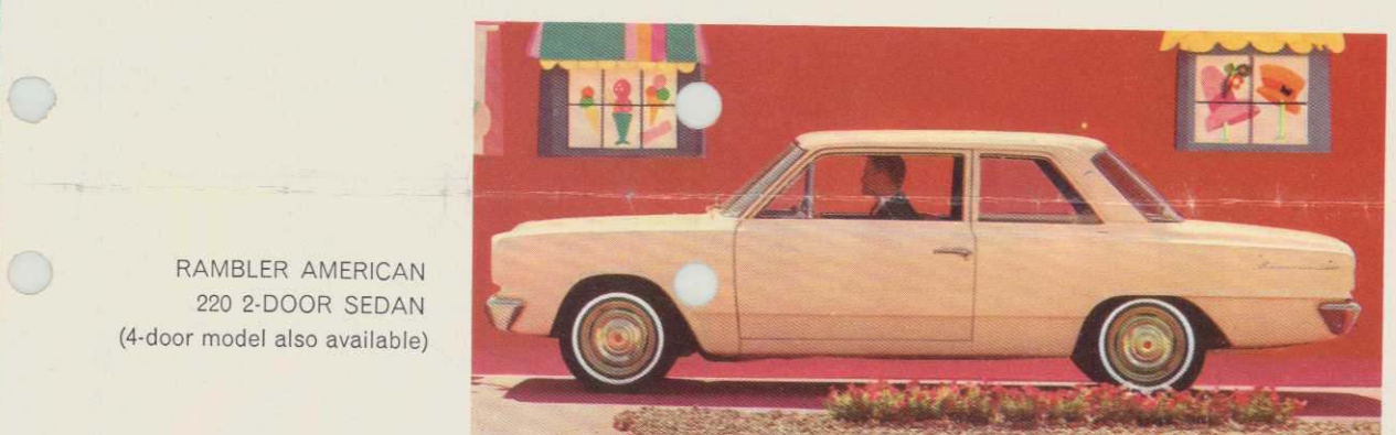
RAMBLER AMERICAN 220 2-DOOR SEDAN (4-door model also available)