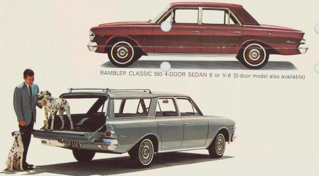
RAMBLER CLASSIC 550 4-DOOR SEDAN 6 or V-8 (2-door model also available)