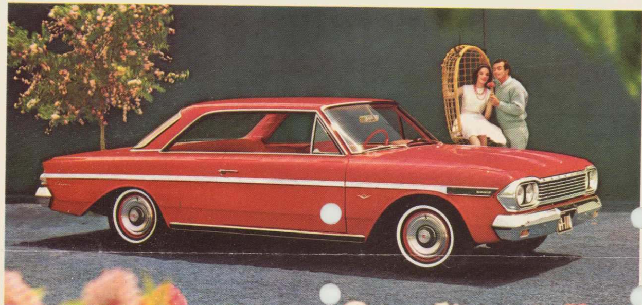
RAMBLER CLASSIC 770 HARDTOP 6 or V-8