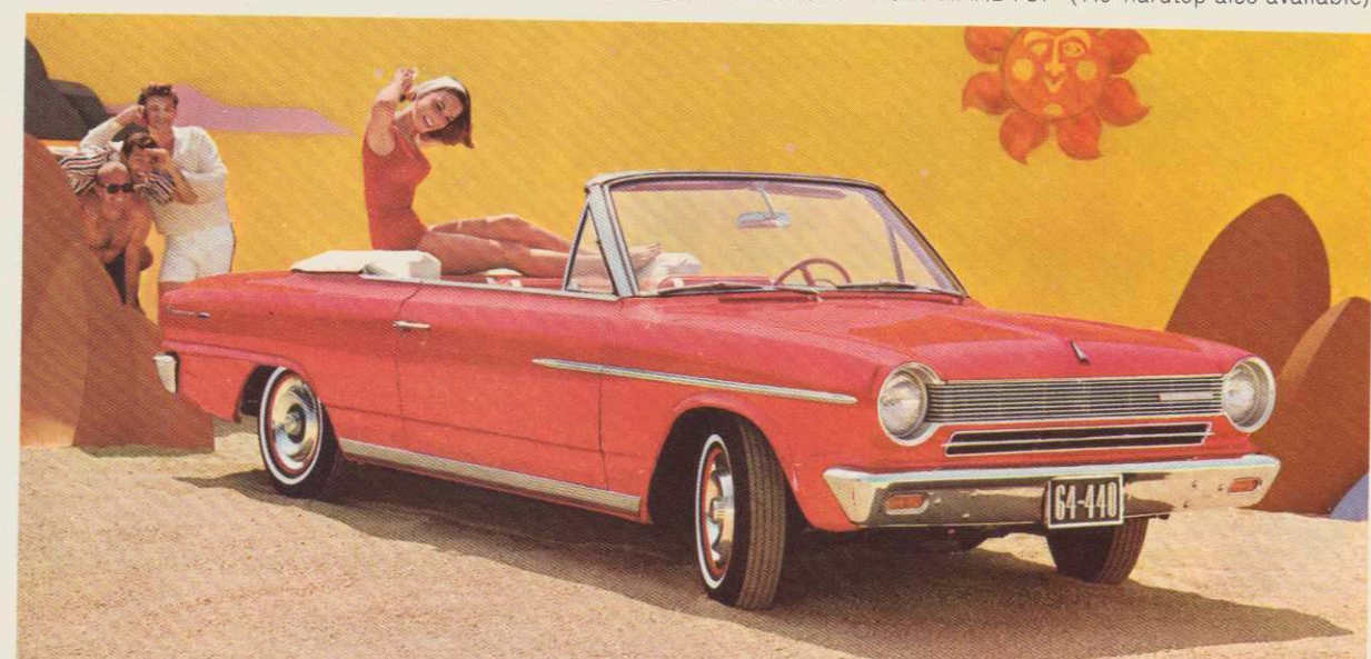
RAMBLER AMERICAN 440 CONVERTIBLE