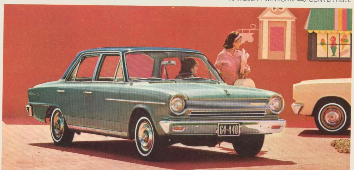
RAMBLER AMERICAN 440 4-DOOR SEDAN