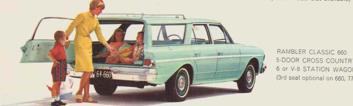
RAMBLER CLASSIC 660 5-DOOR CROSS COUNTRY 6 or V-8 STATION WAGON (3rd seat optional on 660, 770)