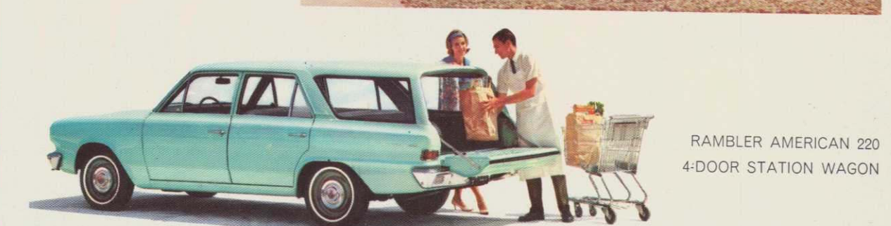
RAMBLER AMERICAN 220 4-DOOR STATION WAGON