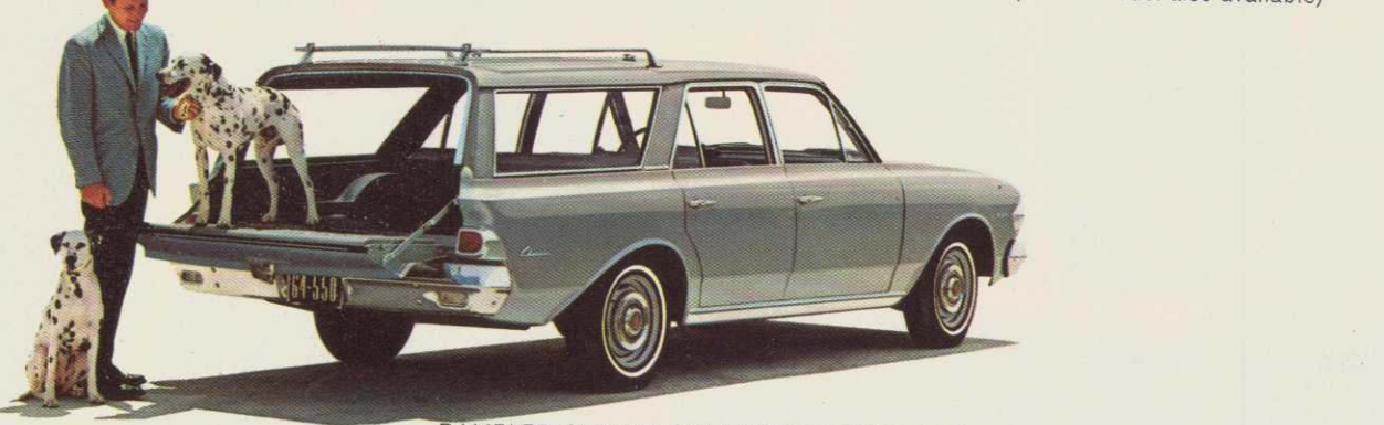
RAMBLER CLASSIC 550 4-DOOR CROSS COUNTRY 6 or V-8 STATION WAGON