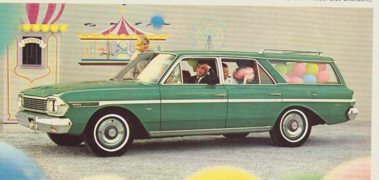
CLASSIC 770 4-DOOR CROSS COUNTRY STATION WAGON 6 or V-8