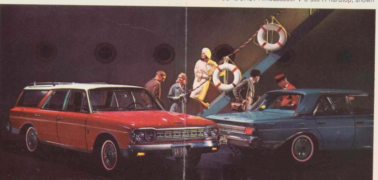
AMBASSADOR V-8 990 CROSS COUNTRY WAGON (3rd seat optional) • AMBASSADOR V-8 990 4-DOOR SEDAN