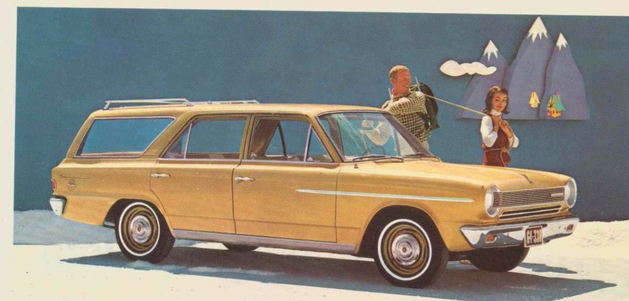
RAMBLER AMERICAN 330 4-DOOR STATION WAGON