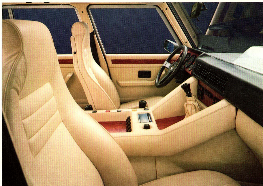
The LM002 features luxurious, glove-soft leather seats and interior trim.